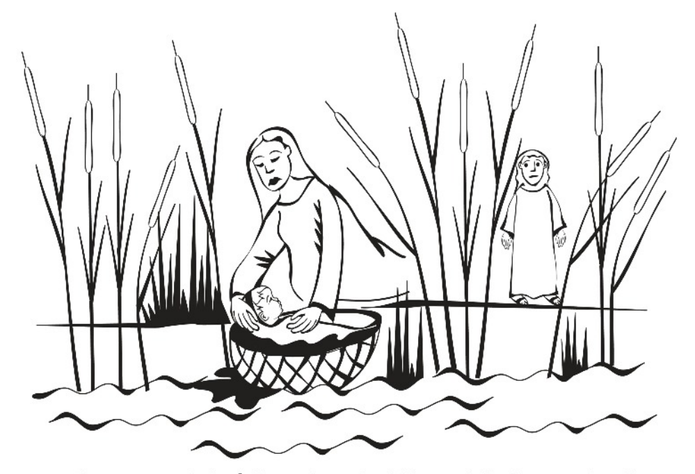
She got a papyrus basket for him . . . she put the child in it and placed it among the reeds on the bank of the river. (Exodus 2:3)