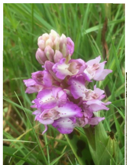
Orchid growing in Manchester Road