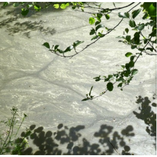
Algae growing on Robin's Pool, in Church Wood