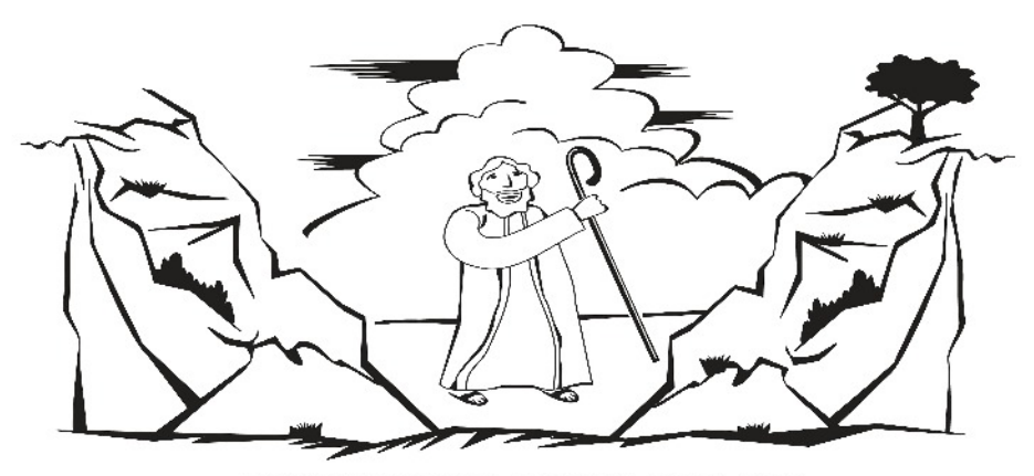
Moses said, 'Show me your glory, I pray'. (Exodus 33:18)