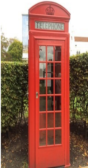
Kiosk No 2

Commission to bring matters into focus. The Commission was formed in May 1924 by an Act of Parliament and was able to examine questions of "public amenity or artistic importance referred to it by government departments and other...bodies". The Commission invited three leading architects - Sir Robert Lorimer, Sir John Burnet and Giles Gilbert Scott (knighted later that year on 22 July at Knowsley by King George V) - to contribute designs for a national kiosk. It was stipulated that the kiosk should ideally be constructed from cast-iron with a unit price not exceeding £40.